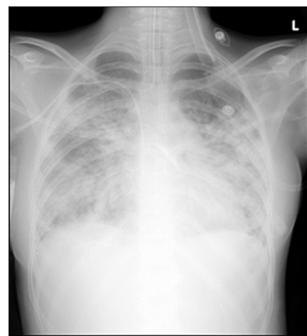
Figure 3: Intensity of bilateral shadow increased (typical ARDS picture)

possible, which is unavailable in this patient. Urinary paraquat concentrations of <1 mg/L within 24 hours of toxicity have a high probability of survival. [5-7] Since patient reported to us after 13 days of ingestion, data