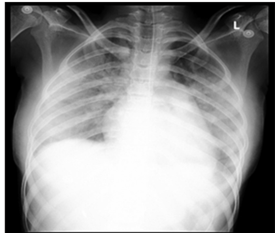
Figure 1: Bilateral diffuse alveolar shadows predominantly in mid and lower zone

Diagnosis of paraquat poisoning is usually made based on circumstantial evidences. It is always important to identify ingested amount of substance as specifically as