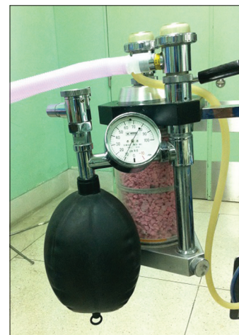
Figure 2: Circle system of anesthesia machine with reservoir bag, used to generate constant continuous positive airway pressure of 10 cm of H 2 O