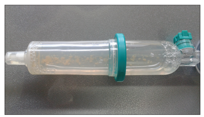
Figure 1: Visible Y-site drug incompatibility reported in our Intensive Care Unit between cefepime and vancomycin

In Table 2, clinical pharmacist interventions for drug-related problems were categorized based on the PCNE classification. A total of 1182 interventions were made by the clinical pharmacist for drug-related problems. Most of the interventions took place at the drug level which was propositions for modification in