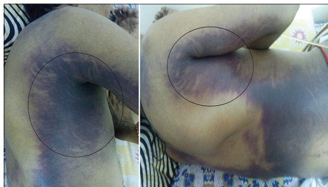
Figure 1: Ecchymosis noted in the right axilla which was deep blue in colour

Etiology of Cullen's sign includes formation of methemalbumin in subcutaneous plane due to digested blood around the abdomen from the inflamed pancreas and the blood likely diffuse via the falciform ligament to the subcutaneous tissue around the