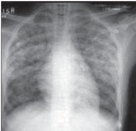
Figure 1: Pulmonary edema due to nitric acid fumes

He was sedated, paralyzed, and mechanically ventilated on pressure controlled mode with low tidal volume maintaining safe plateau pressure and started on antibiotics and steroids. Five hours later, he was noted to have