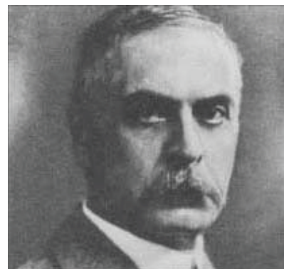
Figure 1: Karl Landsteiner

Using blood samples from his colleagues, he separated the blood's cells from its serum, and suspended the red blood cells in a saline solution. He then mixed each individual's serum with a sample from every cell suspension. Clotting occurred in some cases; in others there was no clotting. Landsteiner