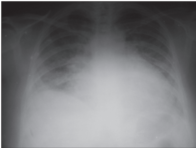
Figure 1: Chest X-ray at ICU admission