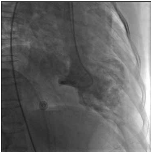
Figure 3: Ventriculogram showing ballooned out apex and hypercontractile basal segment

few hours and she was discharged home after 5 days in hospital. On follow-up a week later, her ECG had returned back to normal. The echocardiogram revealed a normally contracting apex and distal septum and the overall left ventricular function had returned back to normal, with an ejection fraction of 60%.