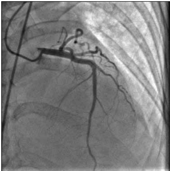
Figure 2: Coronary angiogram showing normal coronary arteries