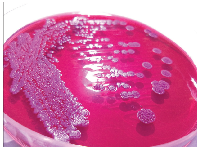
Figure 1: Dry, wrinkled colonies of Burkholderia pseudomallei on MacConkey agar

Melioidosis is an emerging tropical infection most commonly affecting adult men in particular geographic areas where contact with soil is present. [8] Diabetes is the most common risk factor for acquiring melioidosis as reported by many authors including authors from our city. [9] This could be the possible risk factor in our patient as he had a poor glycemic control and hailed from a city where previous reports of melioidosis were not uncommon. The presenting symptom in our patient was joint pain and swelling, consistent with septic arthritis. This sort of presentation has been reported from 18.75% of patients in a study from Chennai. [9] A recent study from Australia has suggested that 25.4% patients presented with septic arthritis suggesting that bone and joint involvement is becoming a common presentation of melioidosis. [10] Among joints, knee joints are the most commonly affected joints,