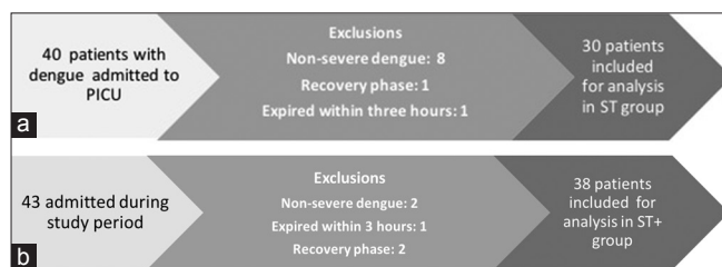
Figure 1: (a) Flow of patients in standard therapy group. (b) Flow pattern of patients in ST+ group

Among the ST+ group, all the seven patients who needed emergent intubation received preemptive strategies to prevent