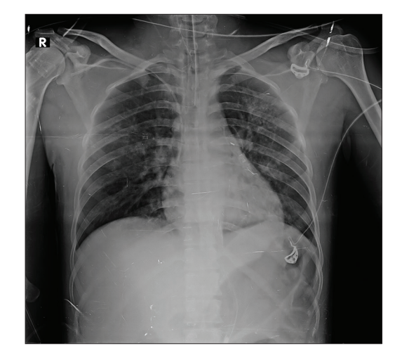
Figure 3: Resolved pulmonary edema after a period of 72 h

pressure. When presenting late after a severe TBI in a patient on mechanical ventilation, infectious and cardiac causes cause a considerable amount of confusion in diagnosing this entity.