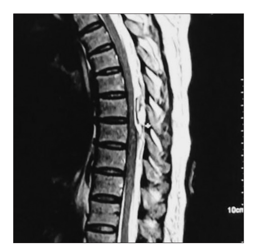
Figure 1: Epidural haematoma as seen on MRI

For spine imaging, an MRI gives far superior quality of images as compared to computed tomography. However, there is always a worry about subjecting the patient with skin staples and internal vascular clips to an MRI for fear of disrupting the staples and internal clips. Most of the previous case reports have mentioned not subjecting the patient to an MRI for the same reason. However, there is some literature available which supports safety aspect of MRI in patients with staples. In an interesting study on pig feet, it was found that it was safe to use MRI in the presence of skin staples as it did not cause displacement or heating of the skin staples.<sup>[8]</sup> Another study has also demonstrated safety of MRI of 3 Tesla or less power in the presence of skin staples and vascular occlusion clips.<sup>[9]</sup> It is vital to confirm the exact diagnosis of a hematoma and its extent before subjecting the patient for an emergency spine surgery.