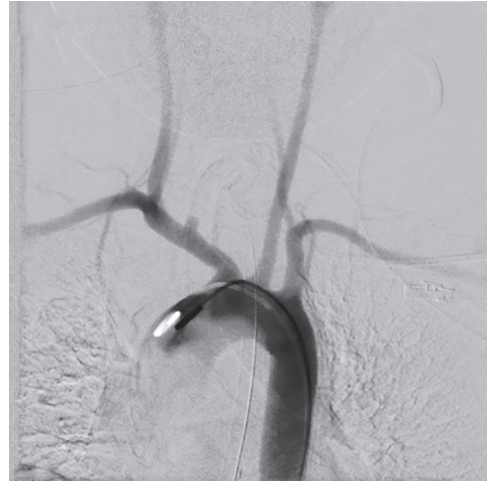
Fig. 2: Pseudoaneurysm from the trunk of the right brachiocephalic artery in aortic arch angiography

to a ventilator, the use of excessive and continuous cuff pressure, infection around the tracheostomy stoma, and malignant neoplastic invasion of a vessel near the trachea. 5