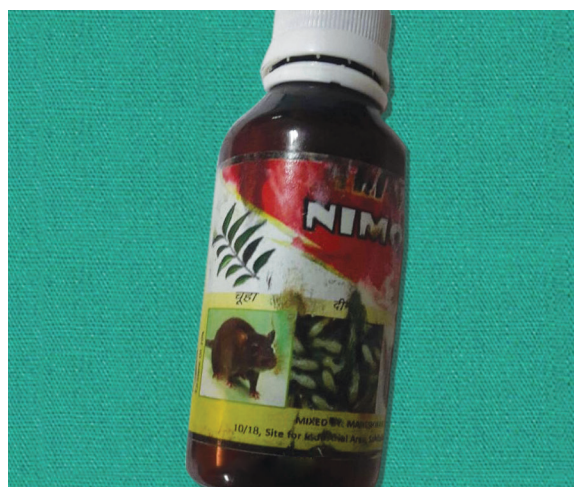
Fig. 1: Bottle of insecticide

Methemoglobinemia occurs when MetHb levels exceeds 2%. Normal MetHb levels are <1%. Symptoms of methemoglobinemia correlate with MetHb level in healthy patients. Cyanosis is reported