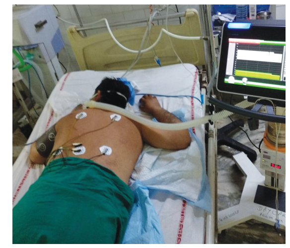
Fig. 2: Image of the patient in prone position on HFNC. Unlike proning on invasive ventilation, on HFNC, patient positioned himself prone and was able to frequently change his neck and limb positions himself

Despite ameliorated chest condition and extubation (Fig. 1B), the patient continued to be tachypneic and hypoxic. During invasive mechanical ventilation, various endotracheal aspirates to look for ventilator-associated pneumonia were done, which all came out to be sterile. He was initiated on HFNC with flow of 45 L/minute at a FiO<sub>2</sub> of 45%. On HFNC, he was comfortable and maintaining a SpO<sub>2</sub> of 91%. His PaO<sub>2</sub>/FiO<sub>2</sub> ratio was 143 on ABG. At this point of time, the study by Lin Ding et al.<sup>2</sup> was discussed in our departmental journal club, and it was planned to attempt PP in our index case while being on HFNC. As he was quite cooperative, he was asked to lie in a prone position if he felt comfortable (Fig. 2). He tolerated prone position well, and 1 hour later of PP when ABG was repeated, his SpO<sub>2</sub> had increased to 98% and PaO<sub>2</sub> was 136 mm Hg on same settings (PaO<sub>2</sub>/FiO<sub>2</sub>: 302) (Table 1). In the following course of his ICU stay, he himself was inclined to stay in the prone position for prolonged periods. Over the next 48 hours, his FiO<sub>2</sub> was tapered