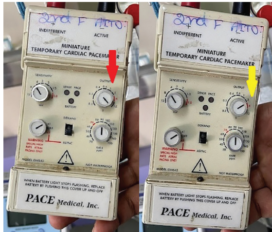
Fig. 2: Reducing the pacemaker output from 12 to 4 V

For confirmation we repeated the same maneuver with pressure support ventilation with flow trigger—2.0, pressure support—12, \text{FiO}_2 —40%, PEEP—5 and could elicit the same results (Fig. 4). Finally, the pacemaker output was reduced to 4 V and the patient was put on pressure support ventilation and extubated at the earliest avoiding any untoward complications.