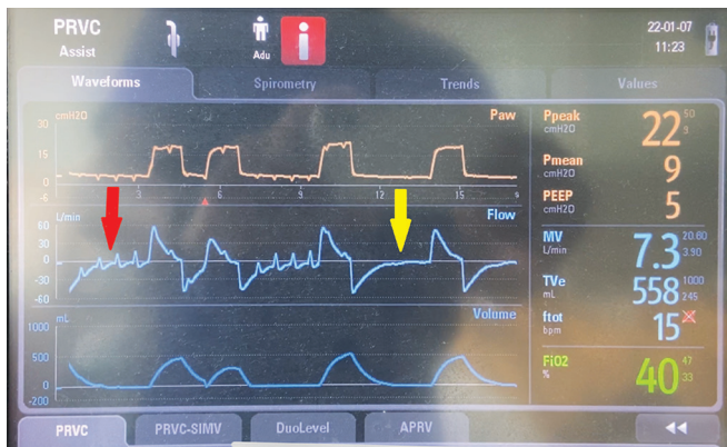
Fig. 3: The waveform is in pressure-regulated volume control mode. The red arrow shows the auto triggering waveforms with 12 V pacemaker output and the yellow arrow shows the resolution of waveforms once output was reduced to 4 V