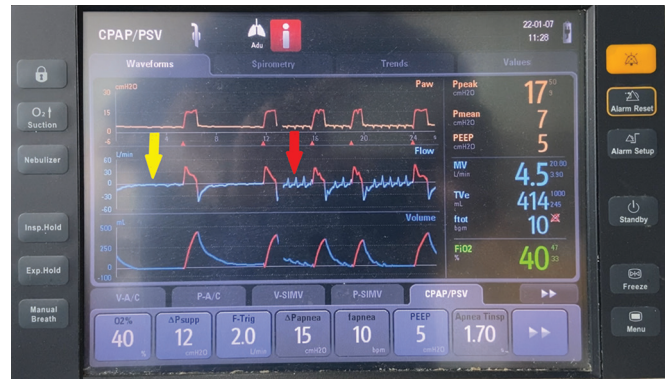
Fig. 4: Waveform in pressure support ventilation mode. The red arrow shows the auto triggering waveforms with 12 V pacemaker output and the yellow arrow shows the resolution of waveforms once output was reduced to 4 V