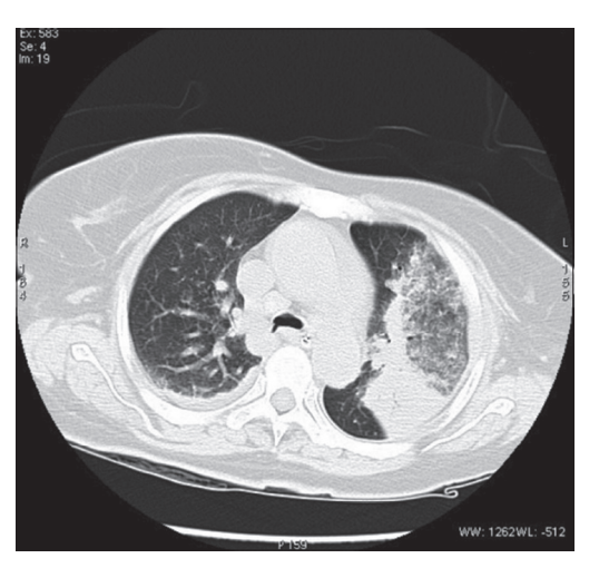
Figure 2: Tomography of the chest showing air space consolidation with multiple nodules in the left upper and middle lobe