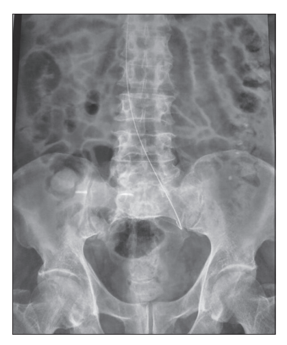
Figure 2: X-ray kidneys, ureters, and bladder showing embolized guidewire

For the management of guidewire embolism, if the guidewire has embolized systemically, chest X-ray and if required X-ray abdomen will determine the position of the guidewire. The percutaneous method of extraction has fewer complications for which interventional radiology techniques such as dormia basket, gooseneck snare, endovascular forceps are preferable.<sup>[4]</sup> Cheddie and Sing<sup>[5]</sup> describe a similar approach for guidewire extraction using a goose snare device.