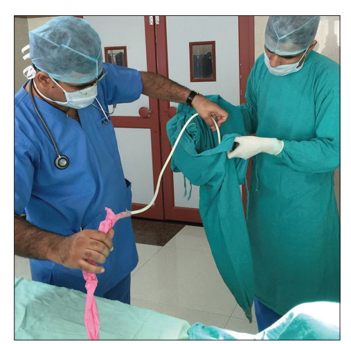
Figure 1: Ultrasonography probe being dropped from sleeve of autoclaved surgical gown

Ultrasonography (USG) is nowadays routinely used in anesthesia and critical care practice for nerve blocks, central venous cannulation, and tapping of pleural or pericardial effusions. There have been reports of bacterial infections transmitted through ultrasound probe and coupling gel.[1] To prevent or minimize the risk of infection, USG probe and its cable are generally wrapped in commercially available sterile disposable sleeve. In case of its nonavailability surgical drape, autoclavable sleeves, surgical gloves, or condoms are used. Of these, gloves are the ones majority of USG users are familiar with. The technique includes wearing two pairs of gloves one above another, holding the USG probe having jelly applied over transducer surface with one hand, followed by removing the outer glove inside out over the probe. However, the technique requires multiple maneuvers to fasten the fingers of the glove just above the probe. In addition, some amount of air is invariably left within the glove which affects image quality. In a modified technique to avoid fastening manures, a finger portion of glove is removed aseptically, and the probe with applied coupling gel is advanced through it to cover the probe. [2] Although "sterile glove" technique allows the probe to be used in aseptic condition, the uncovered accompanying