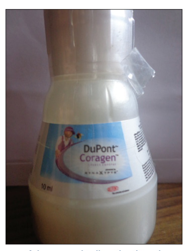
Figure 1: Container of the pesticide alleged to have been consumed by the patient

She was administered 1.2 mg of atropine as an intravenous bolus to revert to sinus rhythm. In spite of multiple doses of atropine, she continued to have bradycardia with repeat ECG showing persistence of AV block. She underwent temporary transvenous pacemaker placement through femoral approach. A transthoracic echocardiogram showed normal ejection fraction and no evidence of regional wall motion abnormalities. Subsequently, her symptoms and hemodynamic parameters improved. Pacemaker was removed after