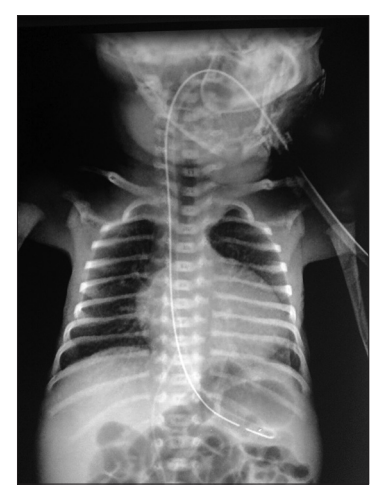
Figure 1: X-ray showing percutaneously inserted central lines in situ and pericardial effusion.

With advances in neonatal care, survival among the extremely low-birth-weight babies has improved significantly. Part of these advances involves total parenteral nutrition and fluid management. PICL lines have therefore become an integral part of these strategies. The need for placing these lines for a longer duration has become a necessity. In spite of the correct position of central lines, clinicians have encountered PCE as a complication.<sup>[5]</sup> Although positioning of the catheter tip at the level of T8-9 is acceptable on X-ray, it has been suggested that the catheter tip is not only outside the cardiac silhouette but also the intrapericardial portion of the great vessels (1 cm outside the cardiac silhouette in preterm and 2 cm in term neonates). Clinical presentations may vary from sudden cardiac collapse to unexplained cardiovascular instability. The cause for such effusions is not clear, but various theories have been suggested based on clinical findings. [6] The authors have attributed the damage to the termination site and the angle at which the catheter lies within the heart, repeated contact of the catheter tip with the cardiac wall may result in endothelial injury and thrombus formation, and this endothelial injury and adherence of the tip to the cardiac wall due to the thrombus may eventually lead to diffusion of fluid in the pericardial space. There are case reports of cardiac tamponade even in