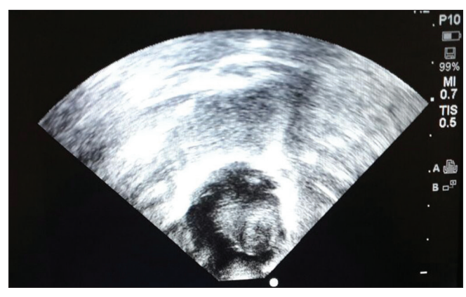
Figure 2: Echocardiography showing evidence of pericardial effusion.