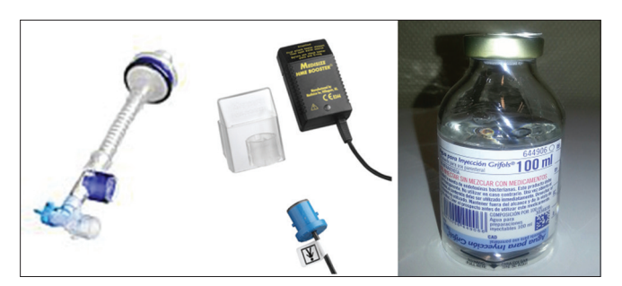
Figure 1: Heat and moisture exchanger Booster components