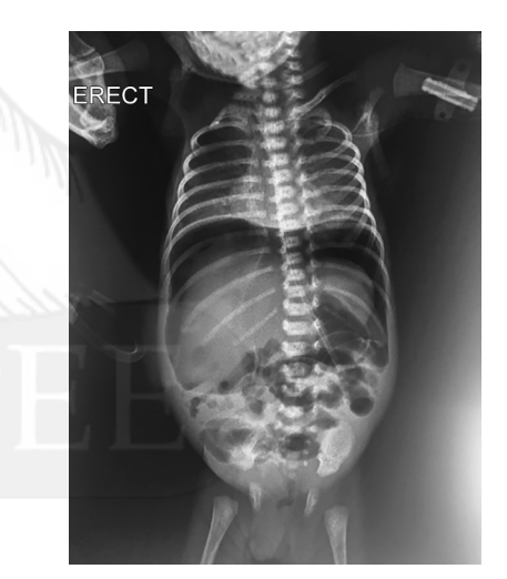
Fig. 1: X-ray picture of pneumoperitoneum after which ileostomy was done

Source of support: Nil Conflict of interest: None